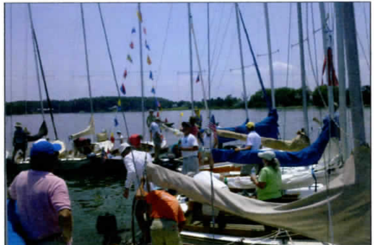
Typhoon raft-up.

See the Typhoon National press release and update about next year's event in the Fleet Events section.