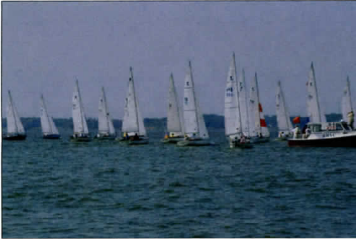
And the race is on! Typhoon National start.

The first ever Typhoon Nationals began Friday, June 10, with a gathering at the Rappahannock River Yacht Club for dinner. We could already see just how cooperative the weather would be, as the thunderstorms rolled in just when the raft-up was planned. Saturday morning, following breakfast and the skippers meeting, the fleet of 31 Typhoons, enjoying a gentle breeze, headed for the river to begin the day's three races. Leaving Carter Creek, the wind started to die down and after multiple delays the decision was to call off the races for the day. Unfazed, participants rejoined for cocktails, dinner, and an evening of high-spirited socializing at the yacht club as the thunderstorms rolled through.